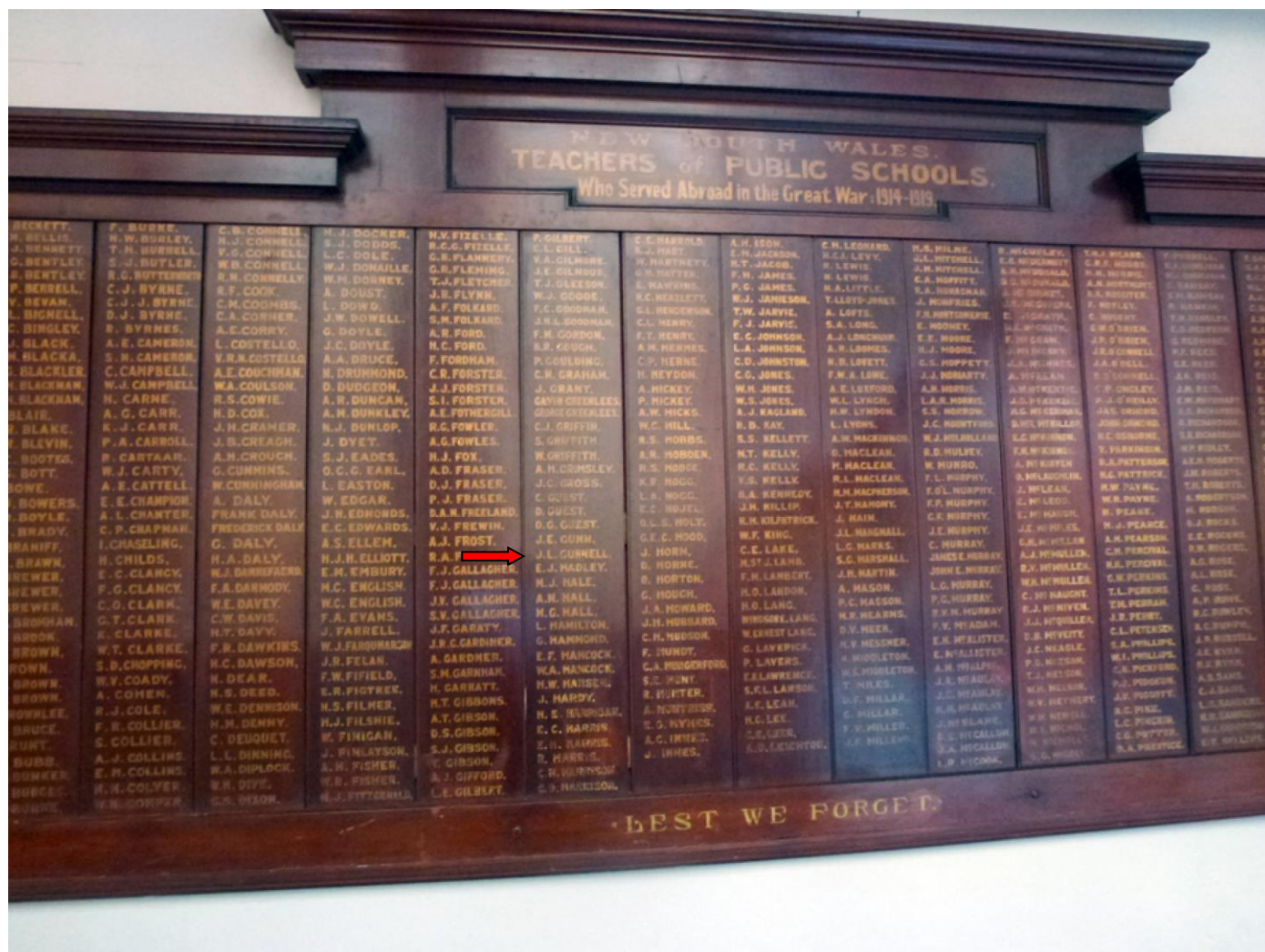
NSW Teachers of Public Schools Who Served in the Great War 1914 – 1918 Roll of Honour