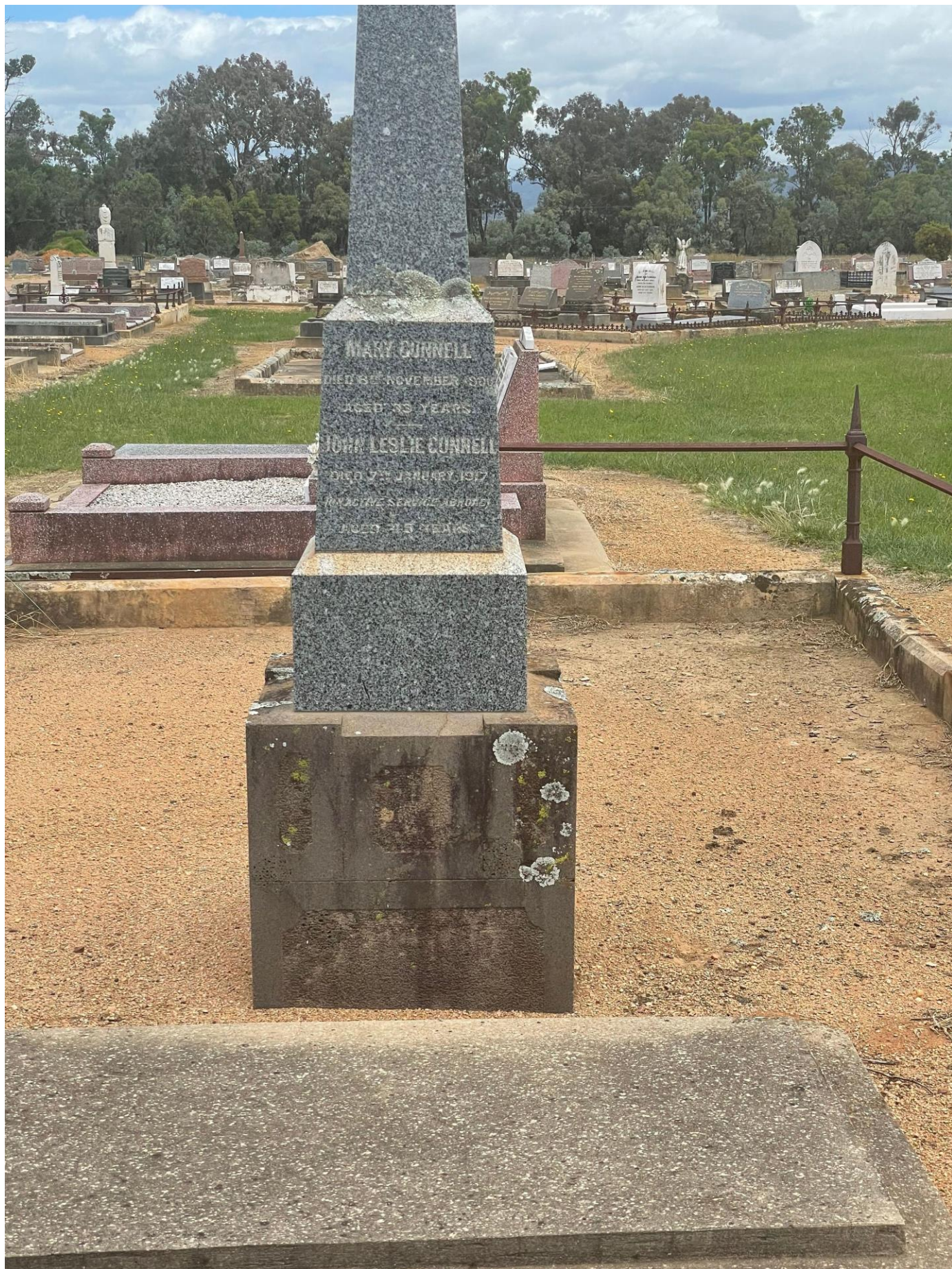
Gunnell Family Headstone